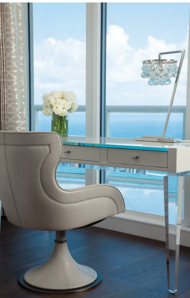
ABOVE: Views of the ocean offer distraction in the master bedroom's office niche arranged with a lacquer and Lucite Allan Knight desk from Stephen Turner, and a graceful Baxter chair from Internum. Pearlescent draperies and dark wood flooring from Contemporary Hardwood Floors create a striking contrast.